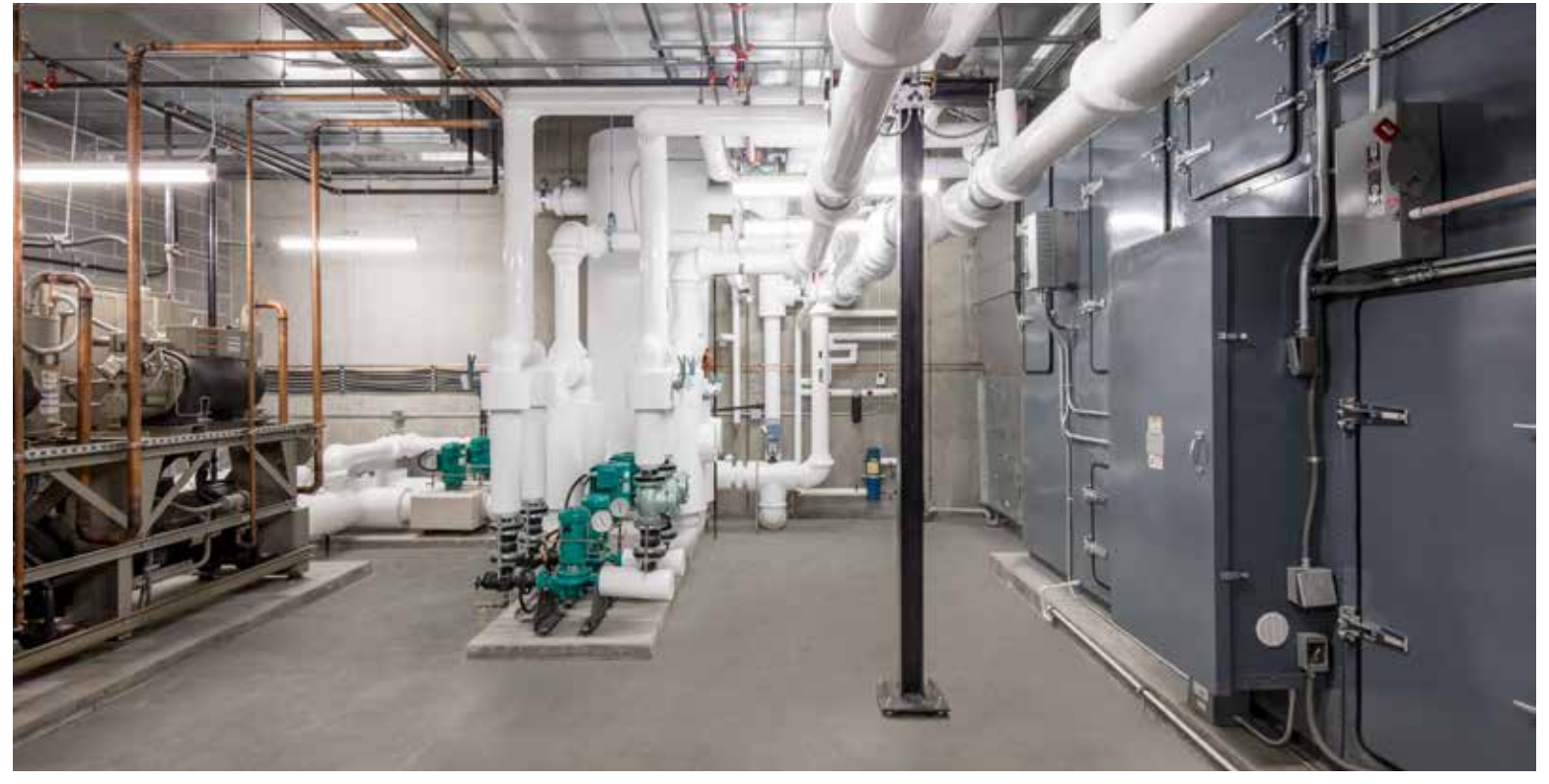
Oversized Mechanical Room for "Living Lab" Concept

Sustainability was paramount in every decision for this project – from the use of an electric district energy plant, to following the "Wood First" materials strategy. The project is targeting LEED® Gold, including 15 points for energy use reduction. The energy plant for this project was also partially funded by BC Hydro as part of their new Electrification program, which is in response to the provincial sustainability goals to de-carbonize British Columbia. This was the first project in the province to qualify for the funding.