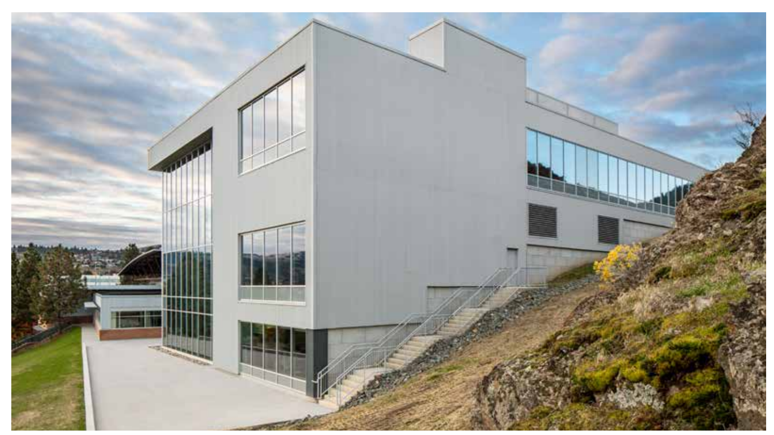
Industrial Training and Technology Centre on the hillside

Lastly, due to TRU's desire to innovate and reduce their carbon footprint, the mechanical systems designed for the building were not "business as usual" and had to interact with the existing adjacent building to meet the decarbonization goals of the project which is expected to have a 260,000 Kg of CO2e reduction, helping TRU meet their strategic goal of a 33% reduction in GHG emissions by 2033 compared to 2007 levels, and to have 10% of the campus be energized from renewable sources.